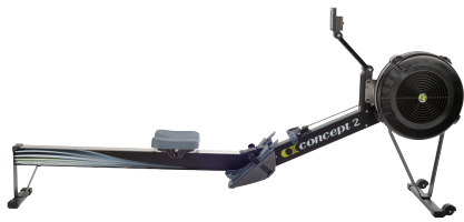
Model D (Shown in Black)

All prices are in US dollars and are subject to change without notice. Shipping and taxes (where applicable) additional.